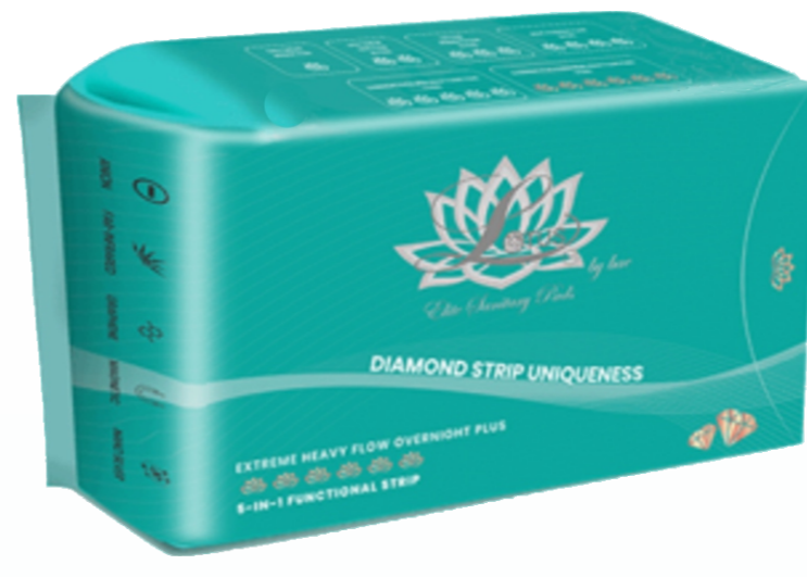
EXTREME HEAVY FLOW OVERNIGHT PLUS