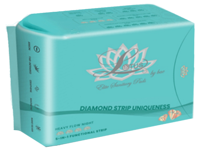
HEAVY FLOW NIGHT