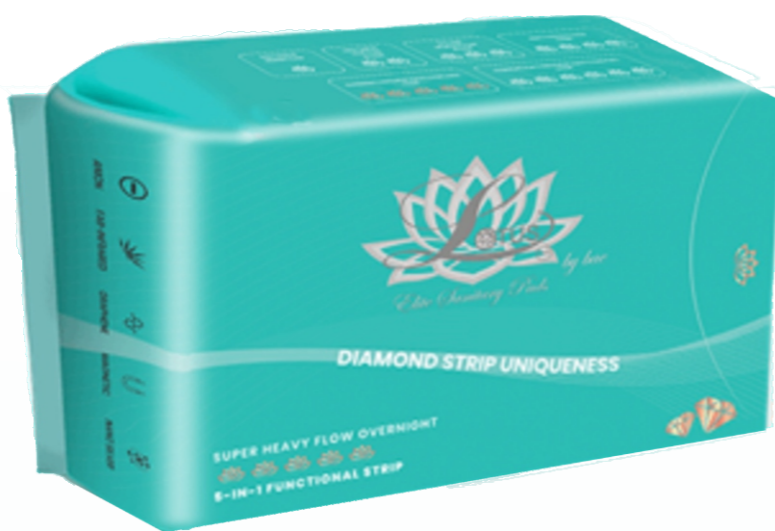
SUPER HEAVY FLOW OVERNIGHT