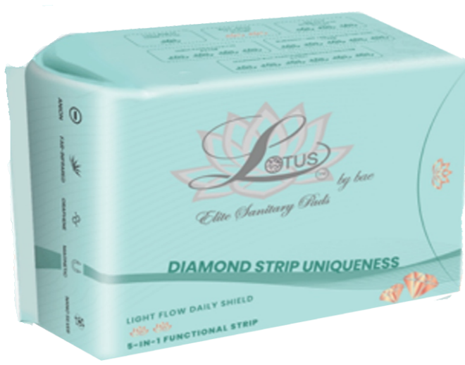
LIGHT FLOW DAILY SHIELD

MSN, APRN, FNP-C, PMHNP-BC Student of Whole Medicine and Healing Nutrition