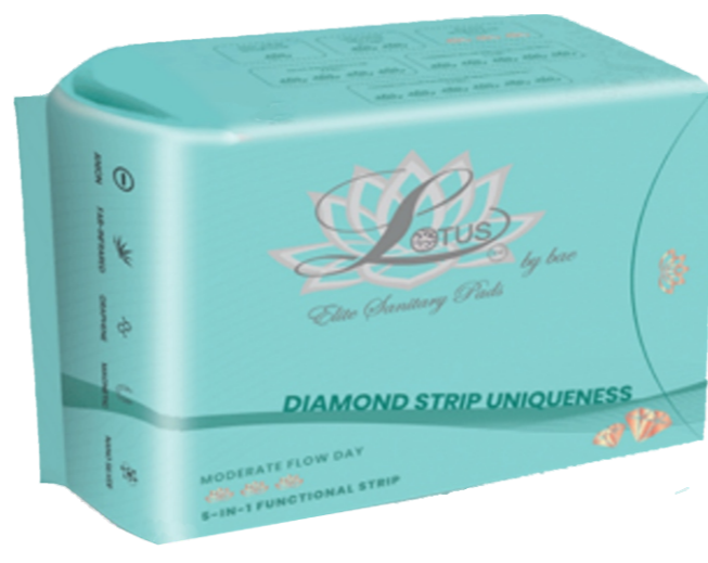
MODERATE FLOW DAY